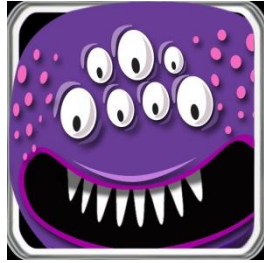
Make a Martian KS1/2