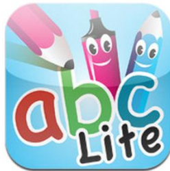
Pocket Phonics KS1