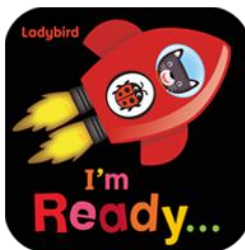
Ladybird Phonics KS1/2