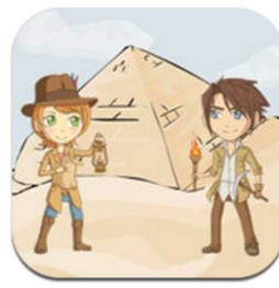
Hear N Spell KS1/2