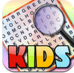
Word Search KS1/2