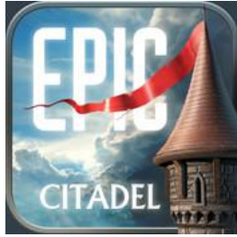
Epic Citadel KS2